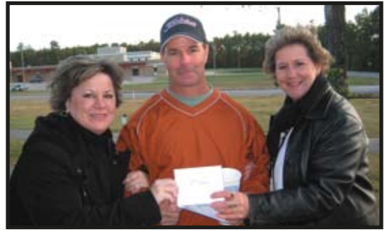
Golf Tournament Second Place Team Captain