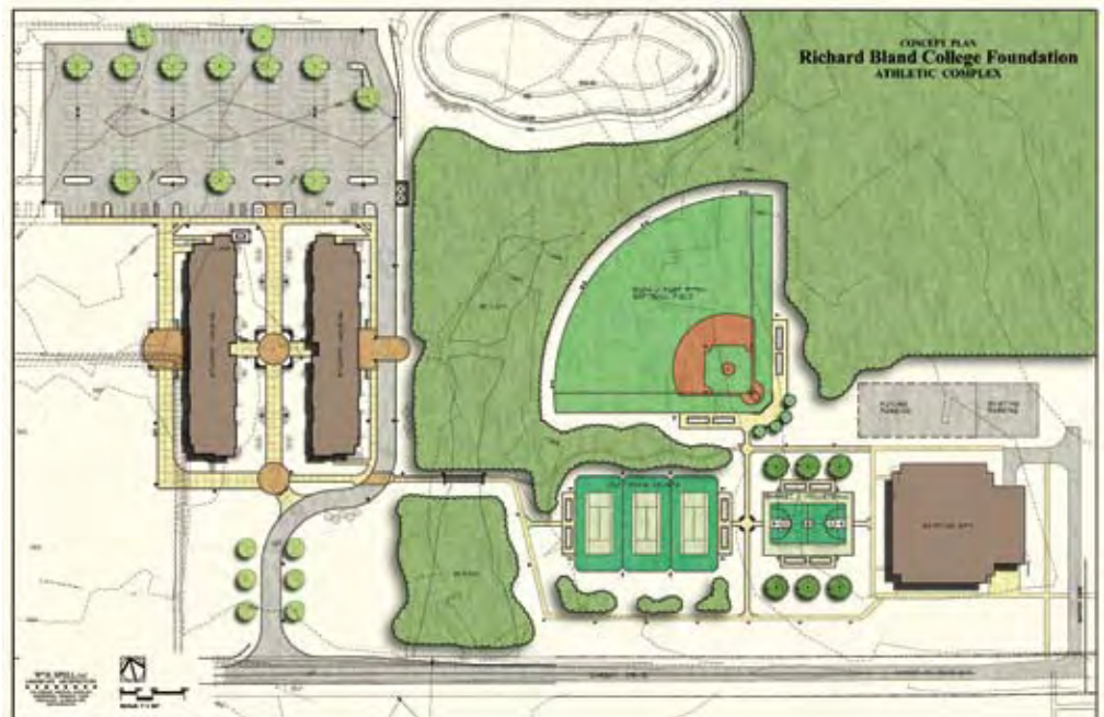
Plan of the new recreation complex between Statesman Hall and the Residential Village.