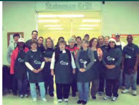
Faculty and staff midnight breakfast, December, 2010.