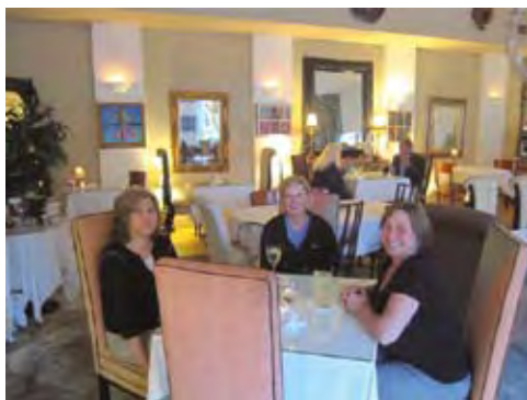
Faculty, staff and friends of RBC enjoying the Bistro while supporting the fundraiser.