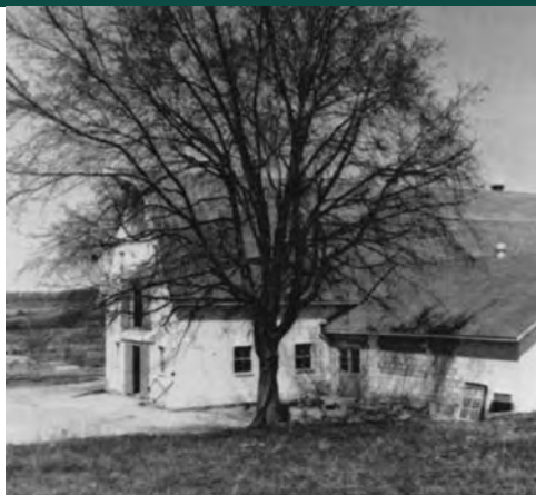
Beginning in the fall of 1963 the "Barn" was converted into a gymnasium.

Thank you for supporting current and future generations of students at Richard Bland College.