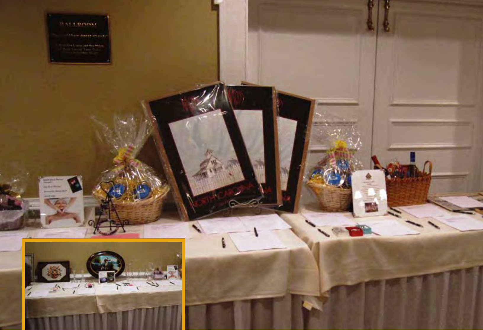
Donated auction items for scholarship Wine Tasting Dinner.