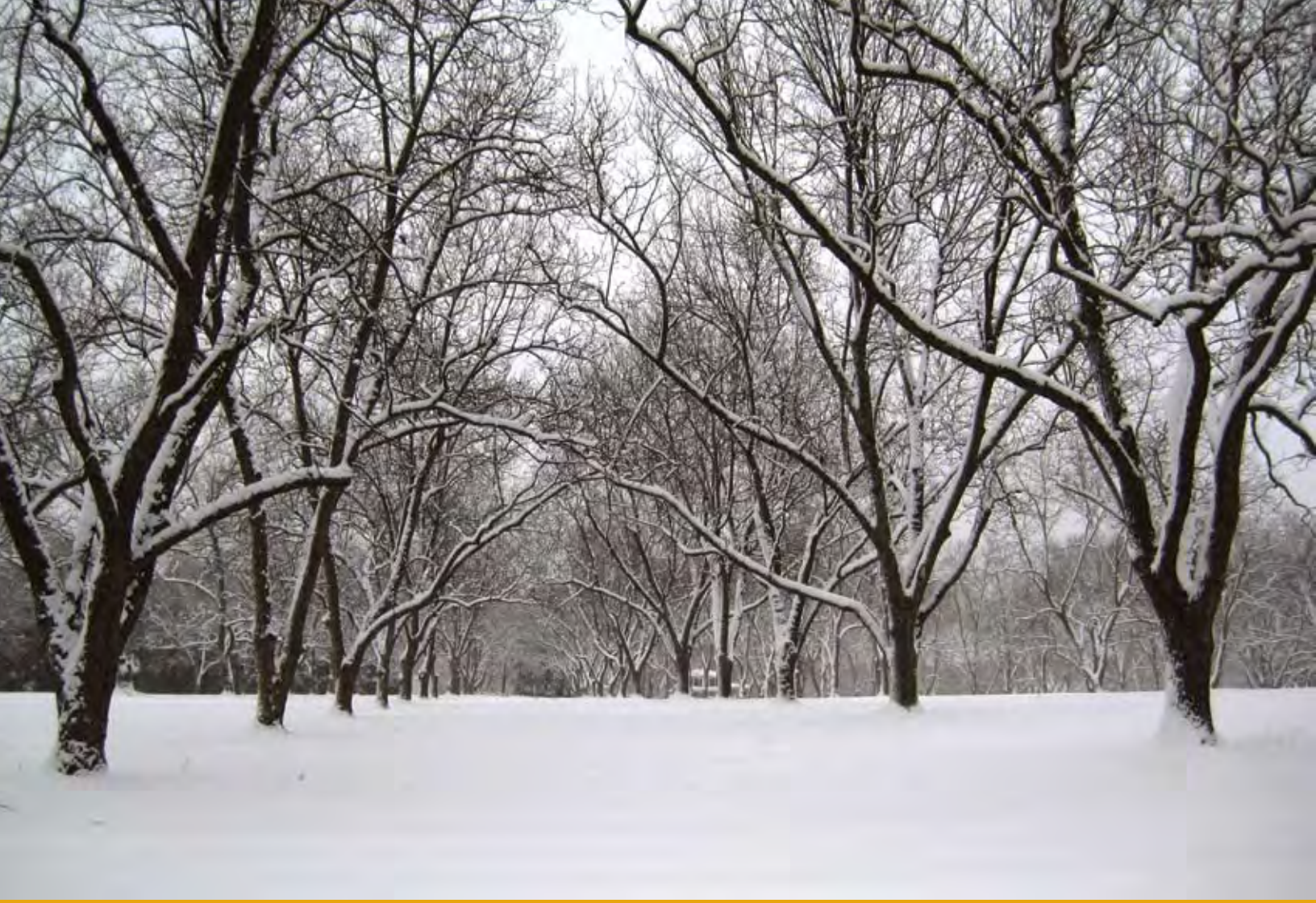
A snowy day at Richard Bland College, overlooking the pecan grove toward the President's house.