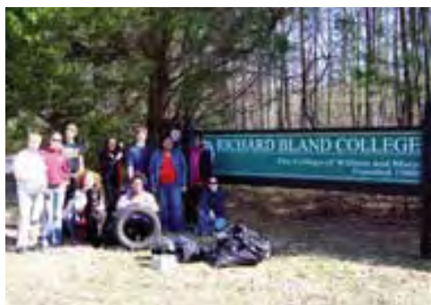
Eleven members of P.E.A.C.