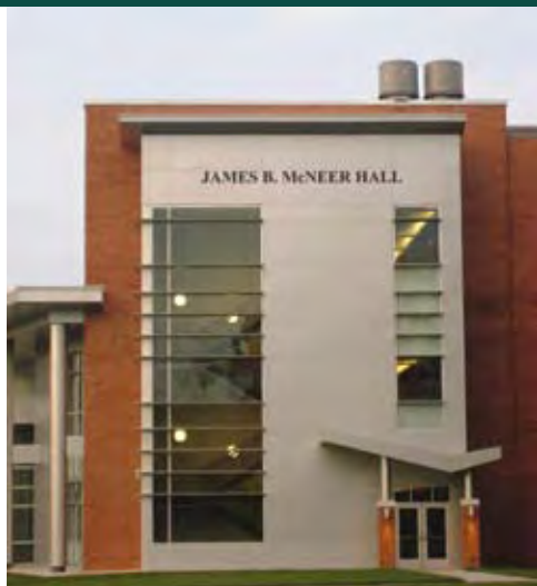
Integrated Science and Technology Center "James B. McNeer Hall."

On December 2, 2010, the Board of Visitors of The College of William and Mary officially voted on a new name for the former Science and Technology Building. The Science and Technology Building opened in the fall of 2010 with state of the art biology, chemistry and physics laboratories and classrooms for math and technology. The 52,000 square foot building will now be known as McNeer Hall.