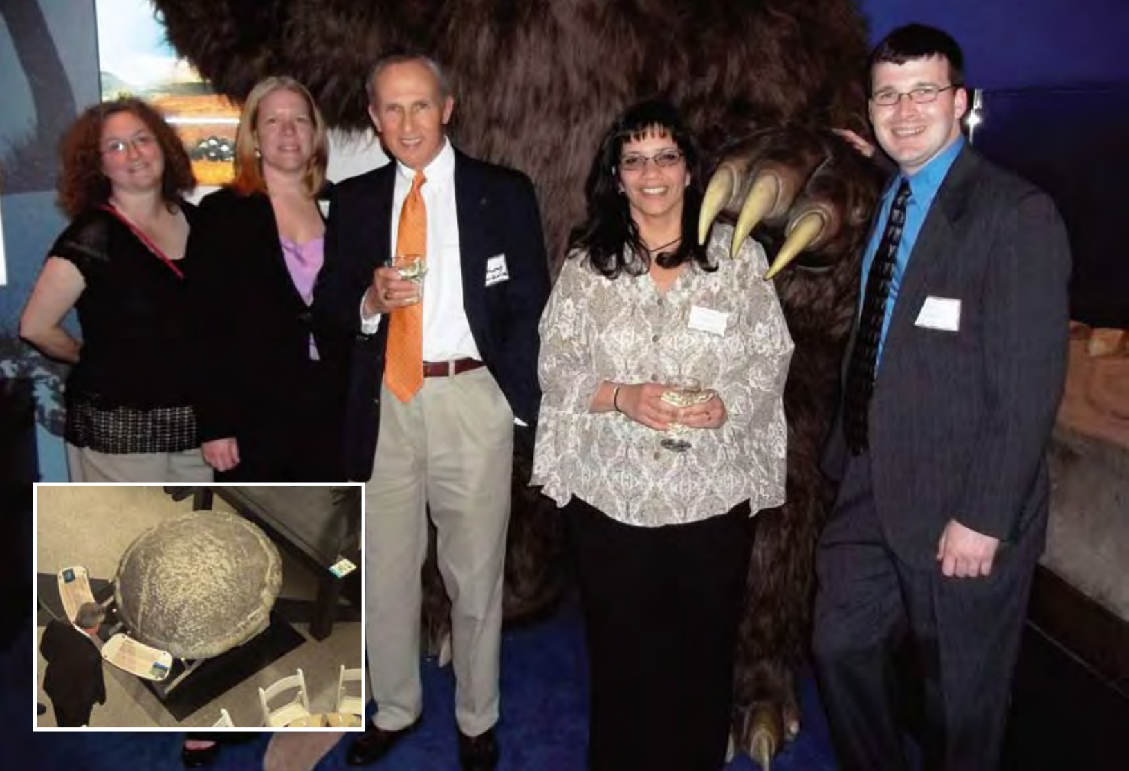
Fossilized Virginia stromatolite shown from above.