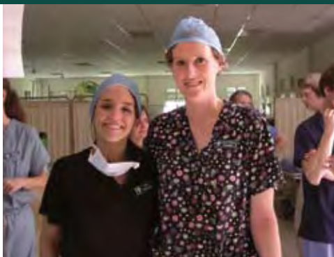
Translators to the OR.