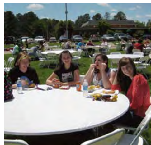
Friends enjoying Carnival Extravaganza.