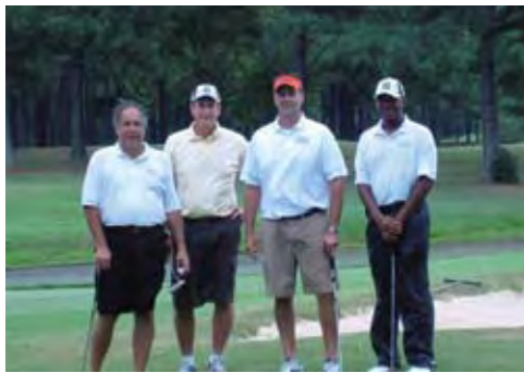
VIP Tournament Sponsor: Southside Regional Medical Center