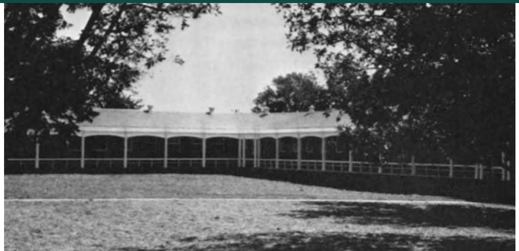
In 1963, the newly renovated wing of the Academic Building provided enlarged offices for Administrative and Business Staff, as well as additional classroom and library space.