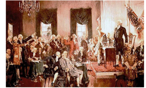
Image of the Signers courtesy of Office of the Curator, Architect of the Capitol.

March 4, 1789: The first Congress under the Constitution convenes in New York City.