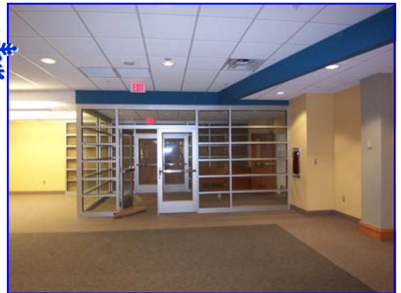
View upon Entering from the Student Center Dining Area