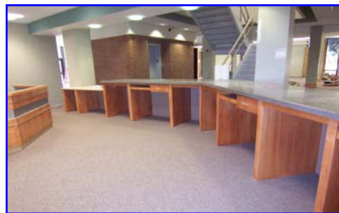
Entrance from the Student Center Dining Area